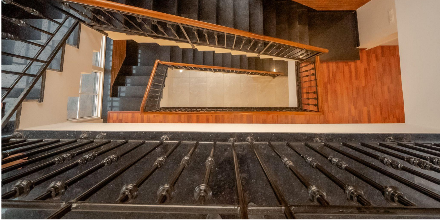
Actual image of a Lobby of an Independent floor built by Prithu