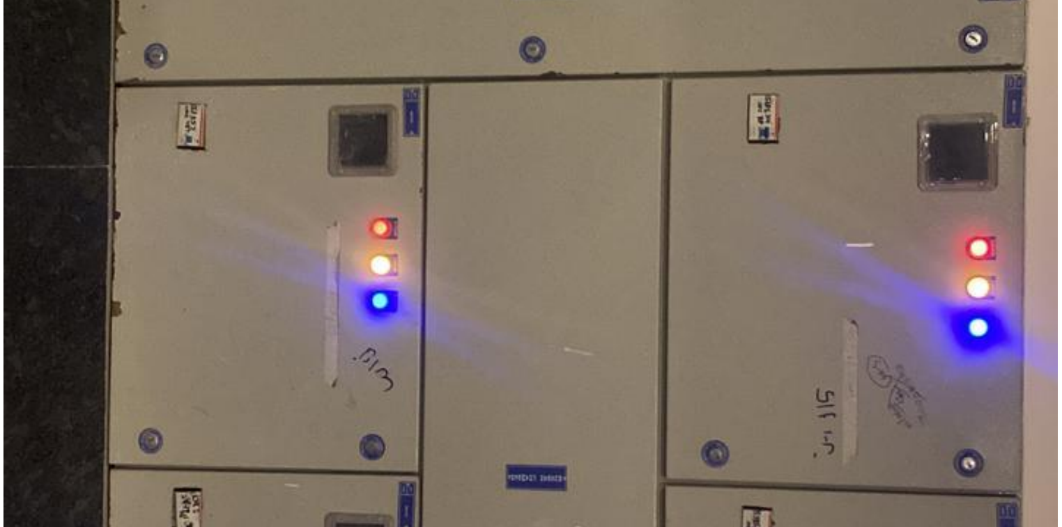
Actual Image of a DB Box in home of the homes constructed by Prithu