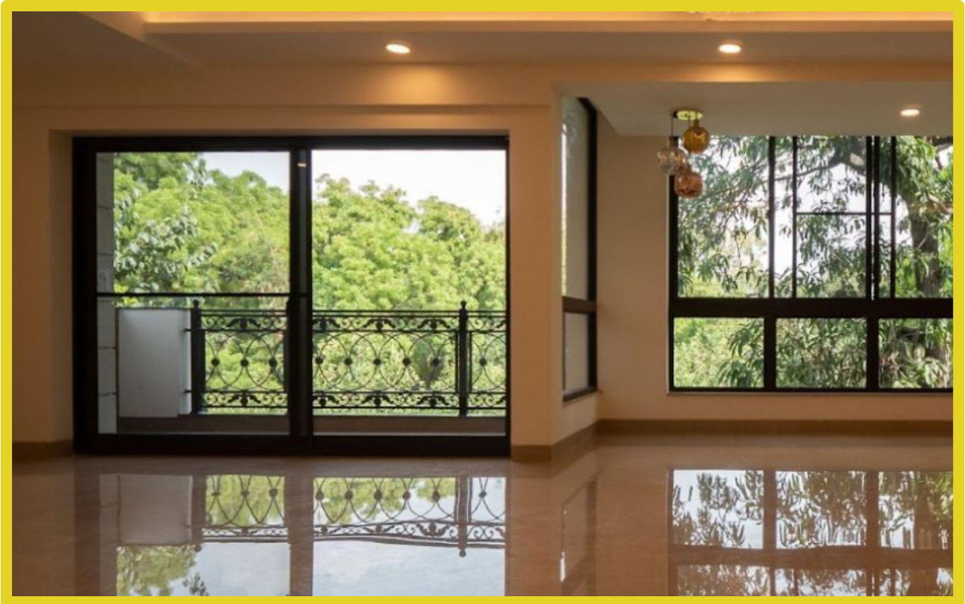
*Actual image of a Gurugram villa inspired by a typical american home

Prithu Homes is the largest builder of custom villas and stilt + floors homes in Delhi, Gurugram, Noida, Ghaziabad and Faridabad. We have 50+ projects under execution and have delivered 43+ projects. We are backed by the Dalmia Bharat family - promoters of one of the largest cement companies in India. Our team consists of 140+ full-time employees consisting of 30+ architects, and 60+ construction professionals drawn from professional institutes like IIMs, DCE, SPA, etc.