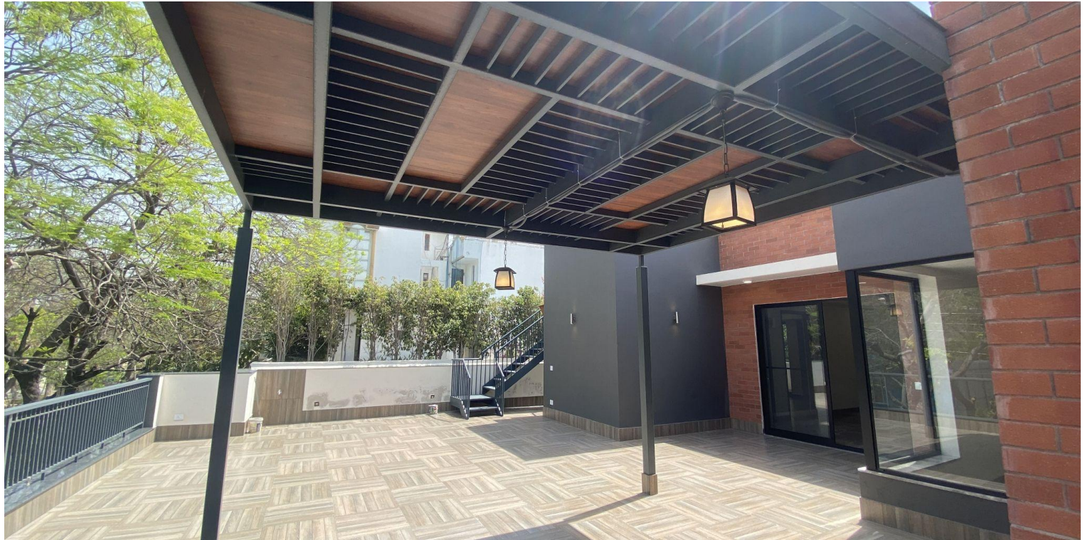
Actual image of a Pergola in a home built by Prithu in Gurugram