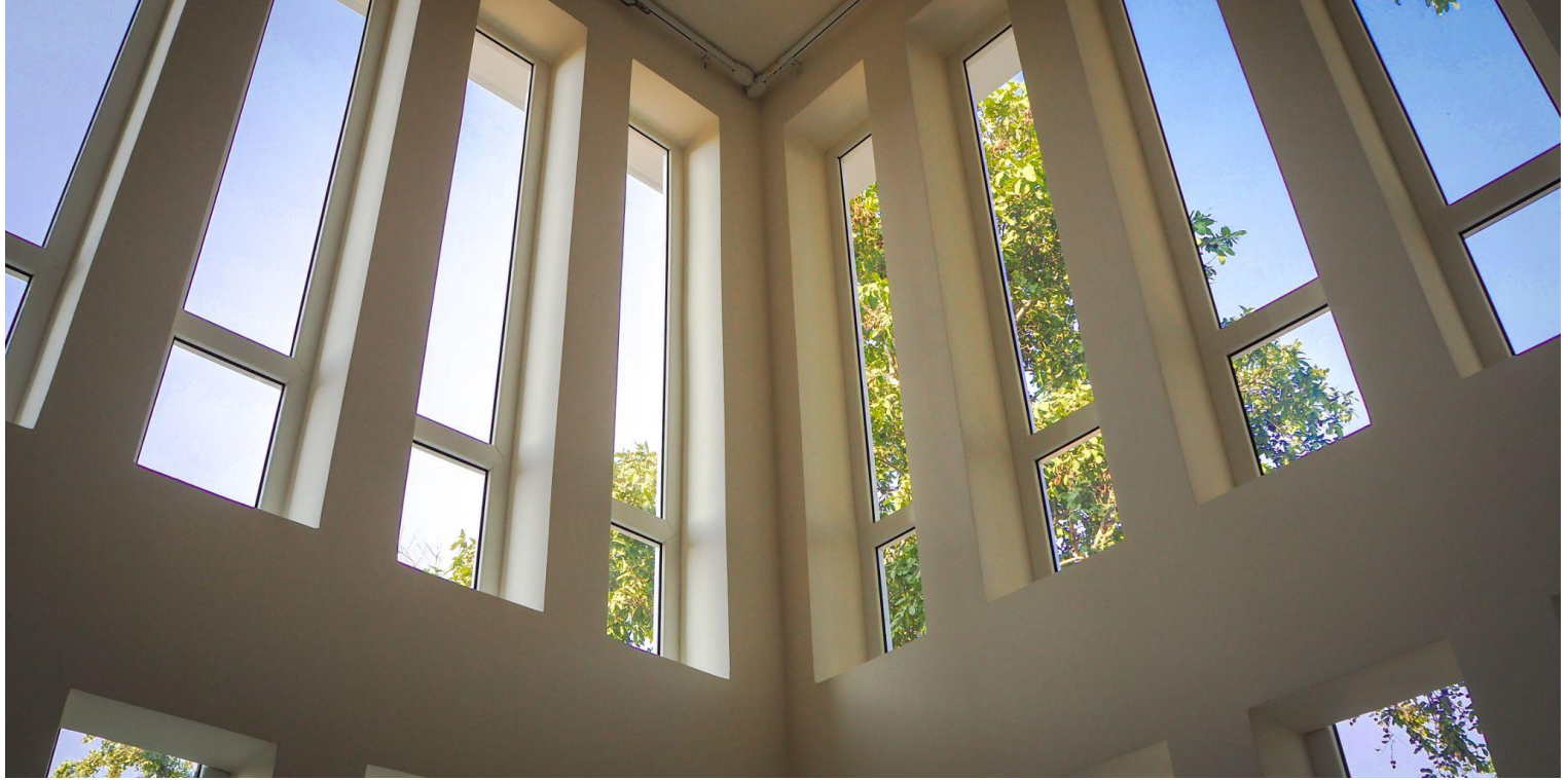
Actual image of a double heightened living room in a project in Noida built and designed by Prithu