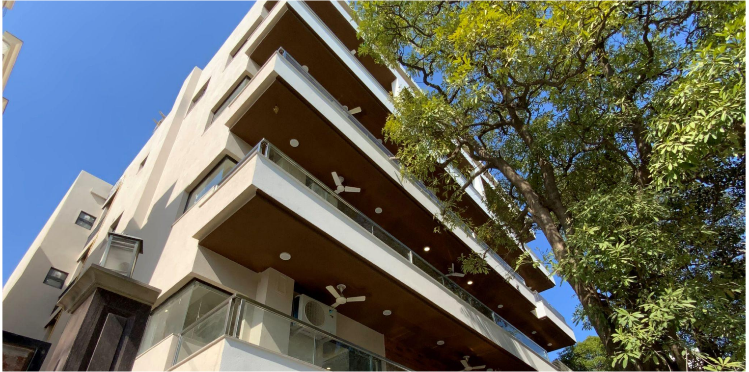
Actual image of one of the Homes constructed by Prithu in South Delhi