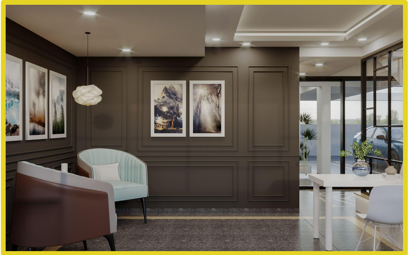
Architect's vision for wrap-around balconies for your home

This is your invitation to live a life of luxury in one of the most sought after addresses in State Bank Nagar, Paschim Vihar, New Delhi