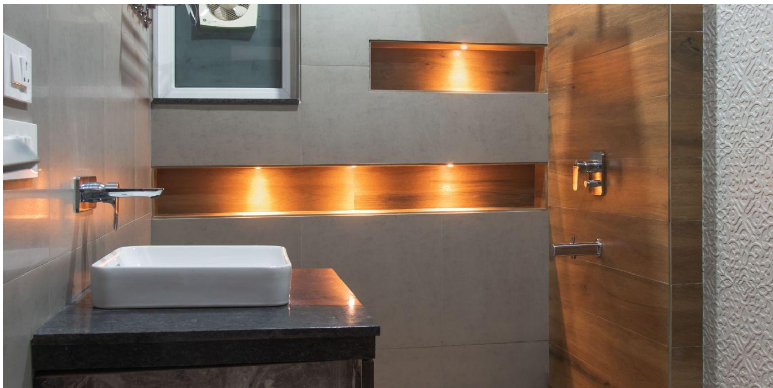
Actual image of bathroom at a home built by Prithu