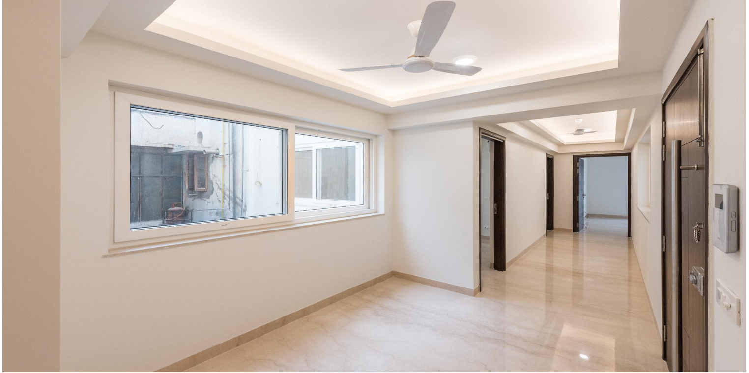
Actual image of a Lobby of an Independent floor built by Prithu