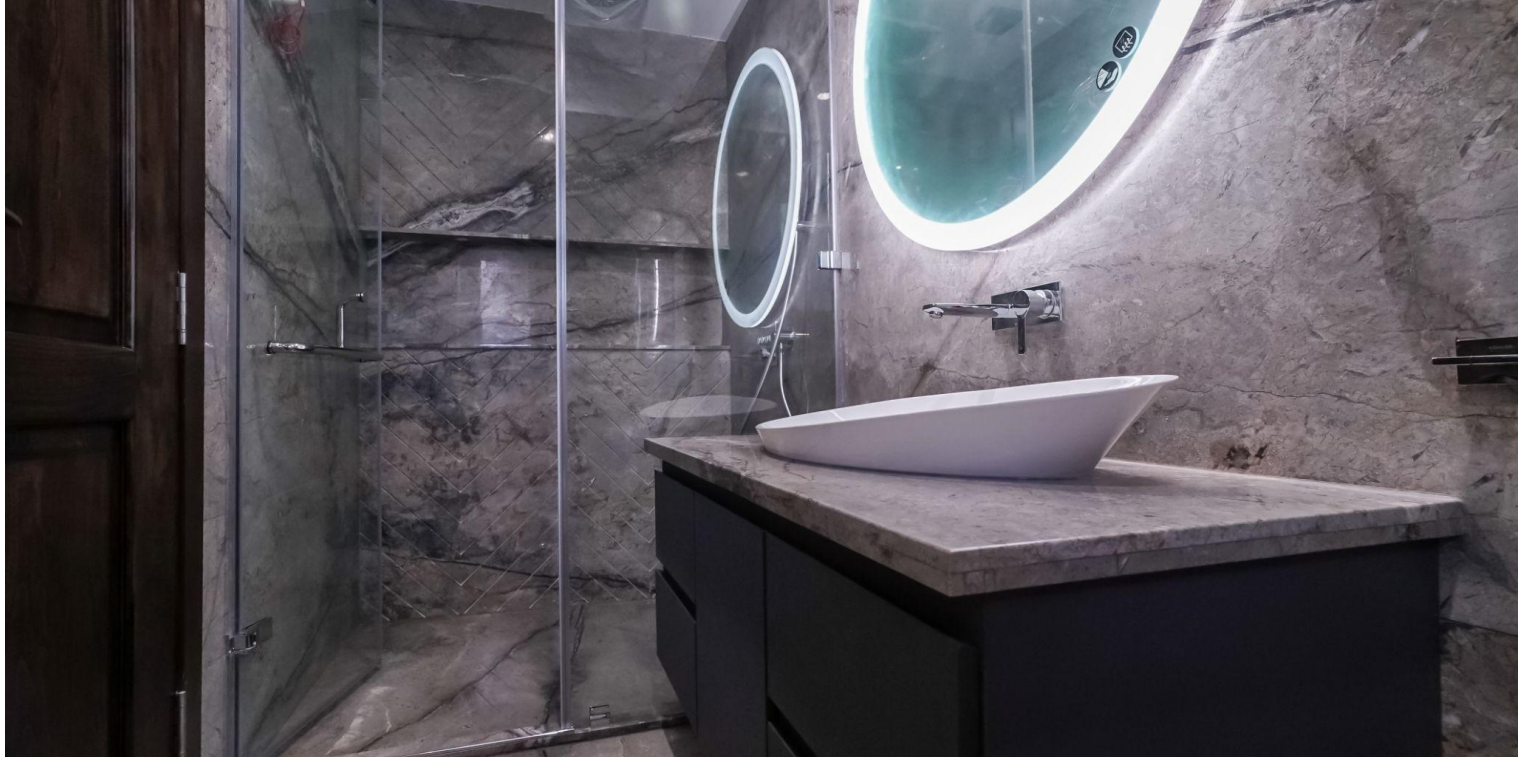
Actual image of a Shower partition in a home designed and built by Prithu in South Delhi