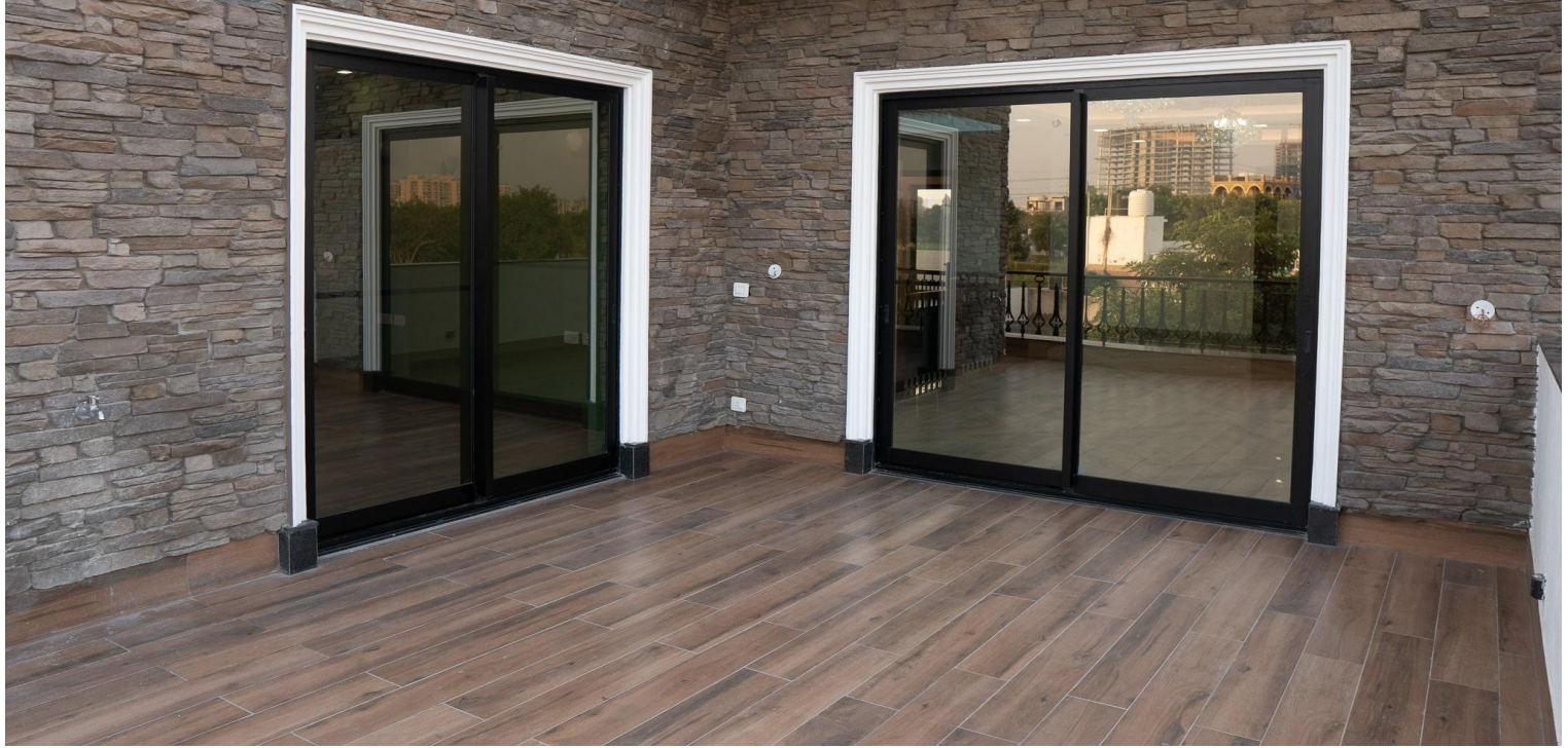
Actual image of Flooring Treatment of a home built by Prithu