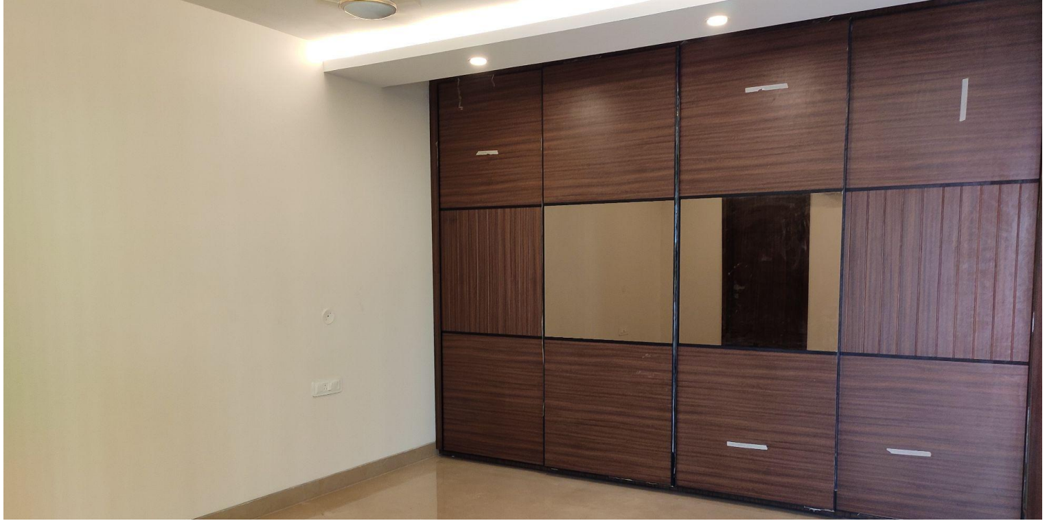
Actual image of a wardrobe of a Independent floor built by Prithu