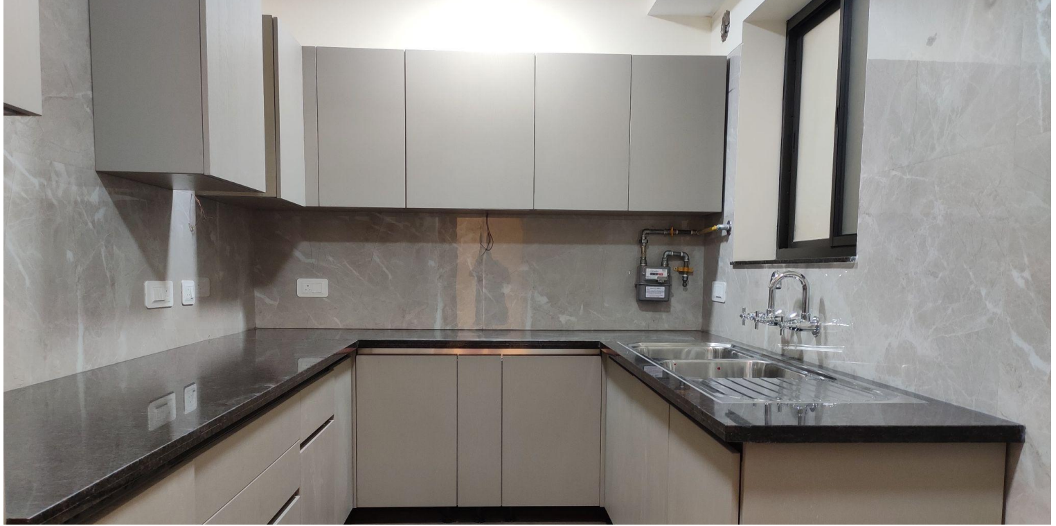
Actual image showing a Kitchen in one of the homes built by prithu in South Delhi