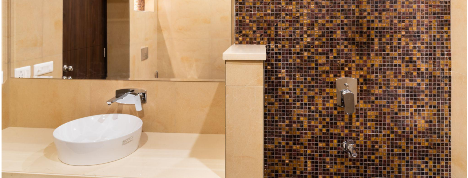
Actual image of a Bathroom of an Independent floor built by Prithu