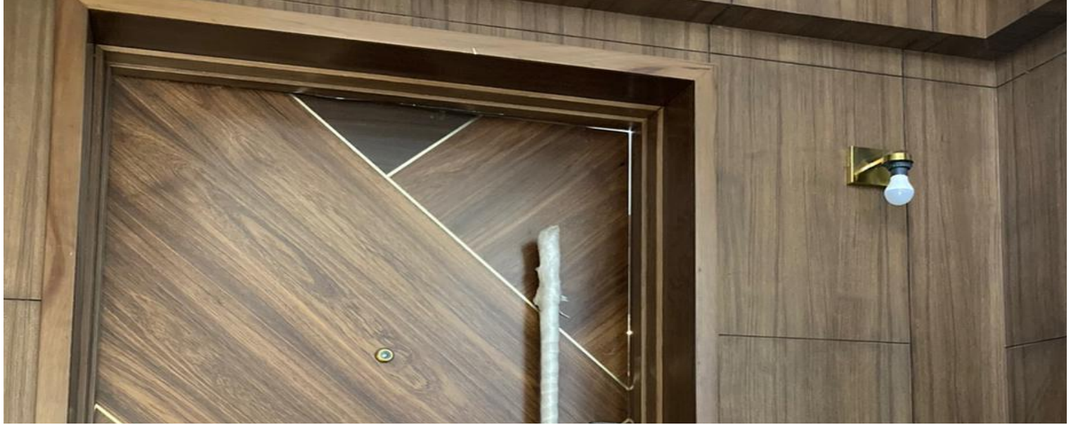
Actual Image of Main door with smart lock for a home built by Prithu