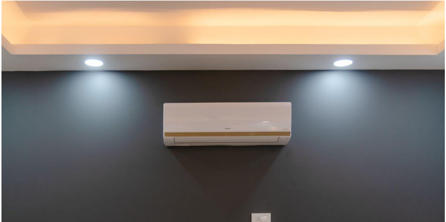
Actual image of a air conditioner in a home built by Prithu