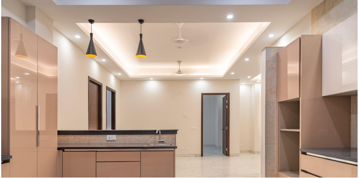
Actual image of a Lobby of an Independent floor built by Prithu