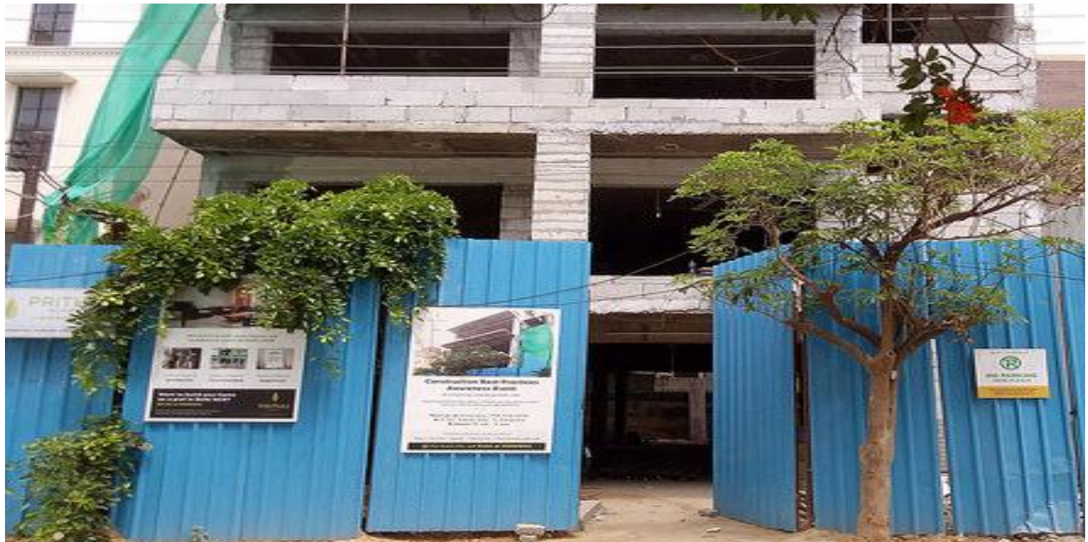
Actual image showing barricading in one of the Prithu project