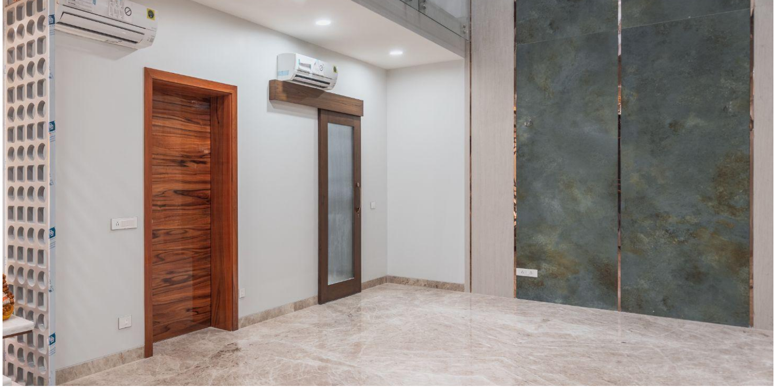
Actual image of Interiors of one of the Homes constructed by prithu in Gurugram