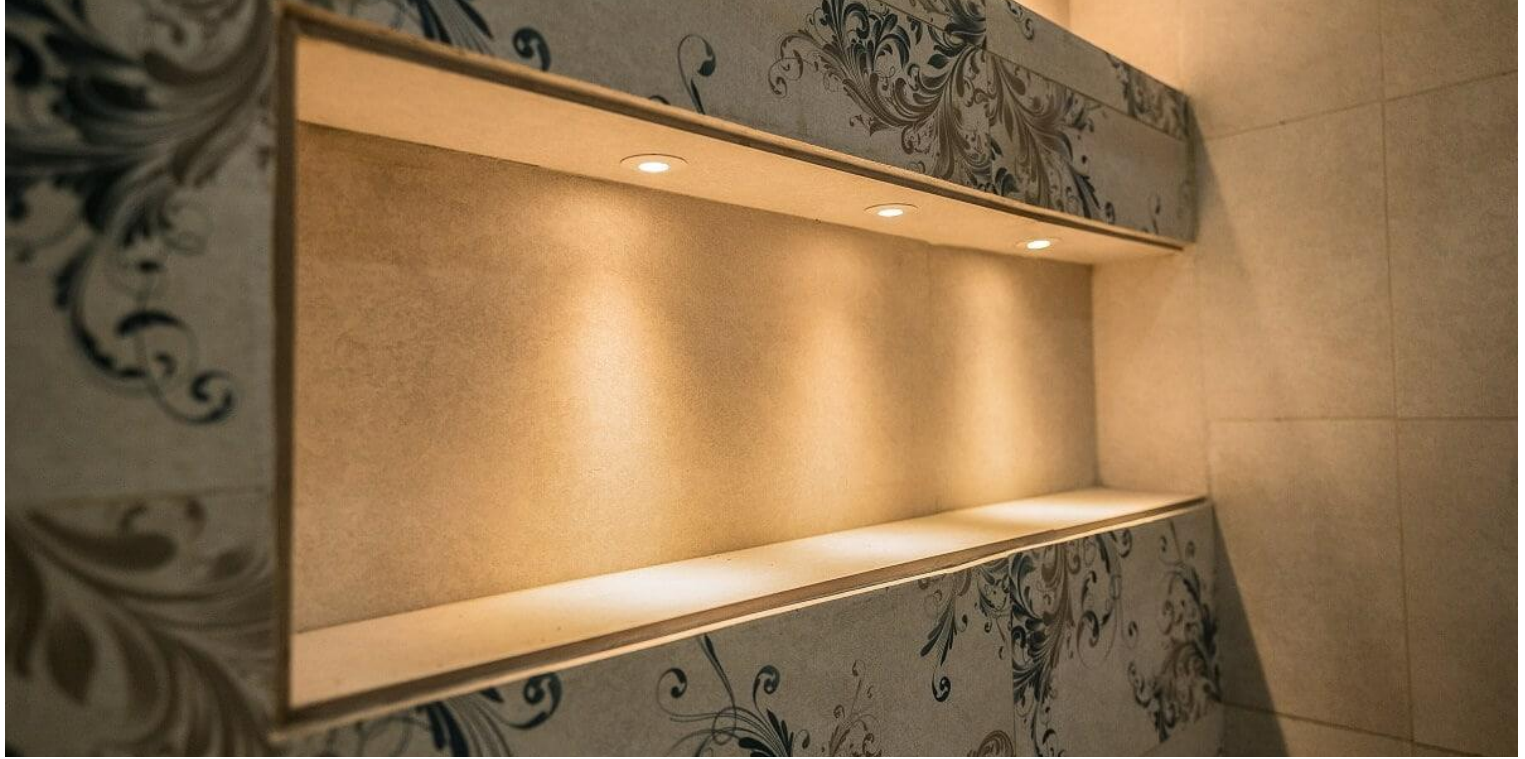
Actual image of a Niche in a Bathroom from one of the homes built by Prithu