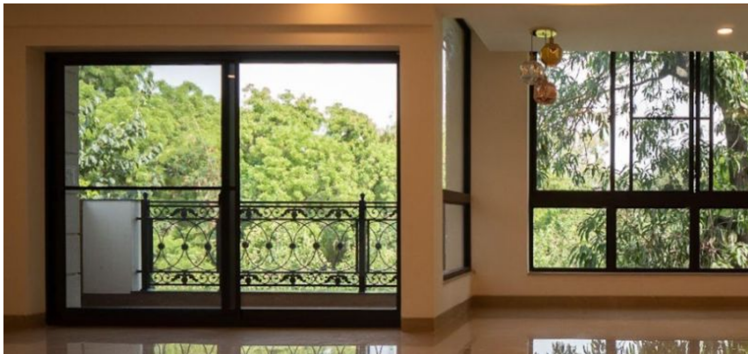
Actual image of a Park facing Living Room of a Independent floor built by Prithu in South Delhi