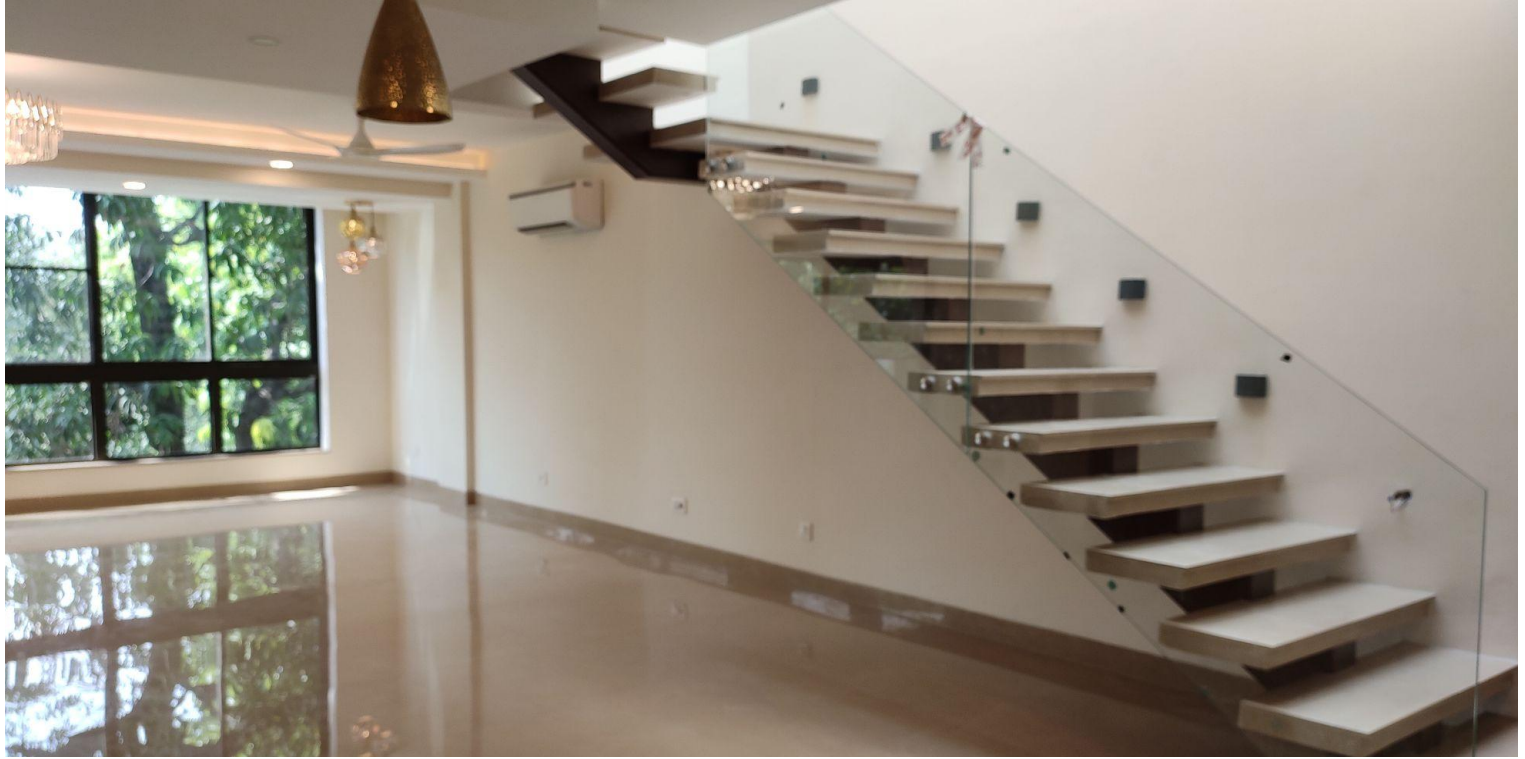
Actual image of a Staircase in a Duplex designed and built by Prithu in B+S+4 home in South Delhi