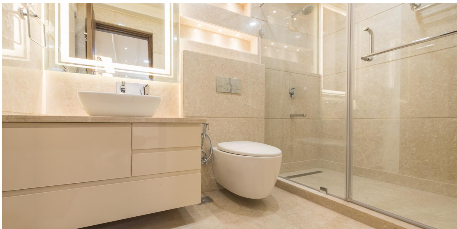
Actual image of a Bathroom of an Independent floor built by Prithu