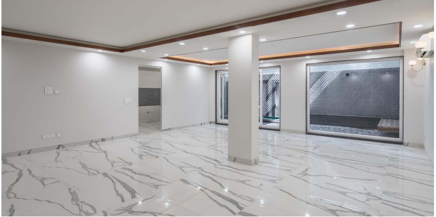
Actual image of Flooring Treatment of a home built by Prithu