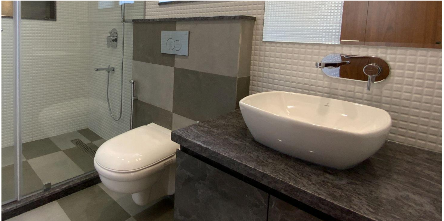
Actual image of a Bathroom of an Independent floor built by Prithu