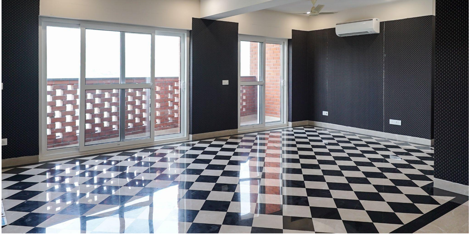
Actual image of Flooring Treatment of a home built by Prithu