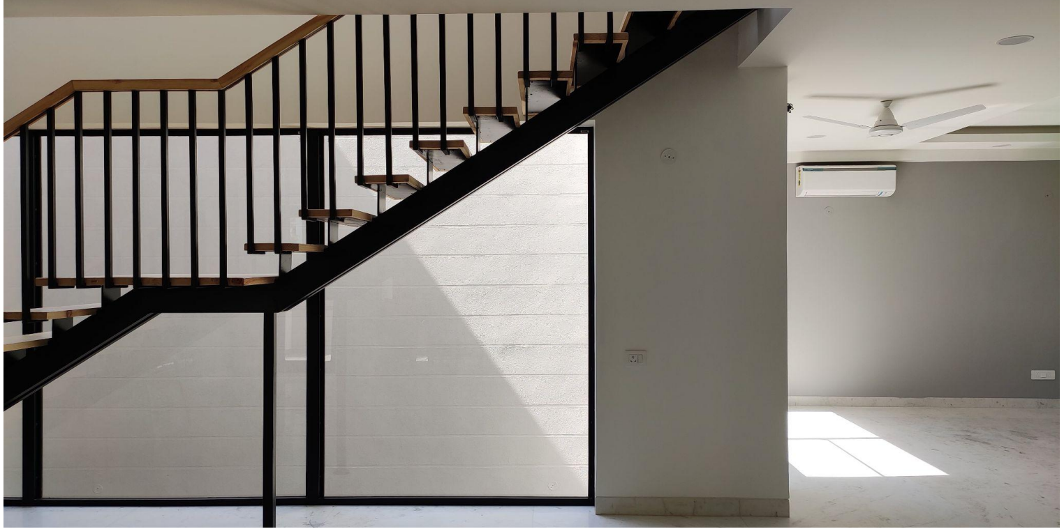
Actual image of a staircase in one of the homes built by Prithu in Delhi