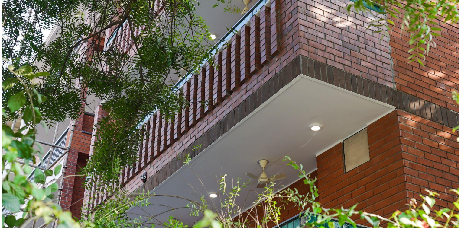
Actual image of a balcony from a home constructed by Prithu in Delhi