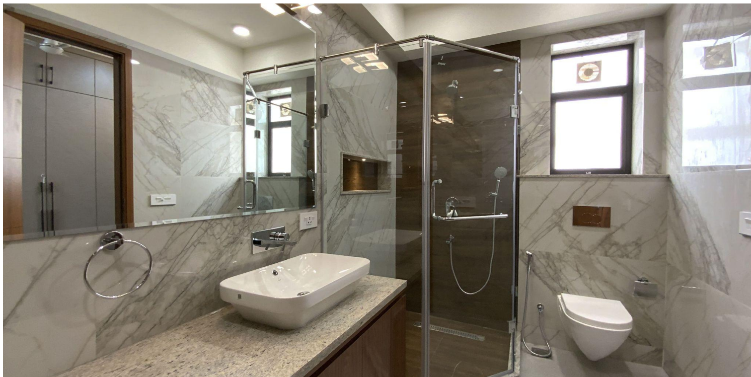
Actual image of a bathroom built by Prithu for a home in Gurugram